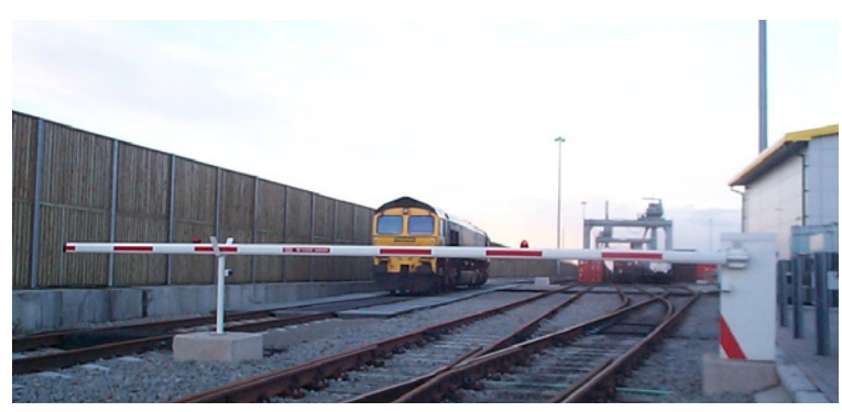
HB Barrier securing 10m aperture

Up to 10 metres Lower folding skirts up to 9m Full height swivel skirts up to 7.5m