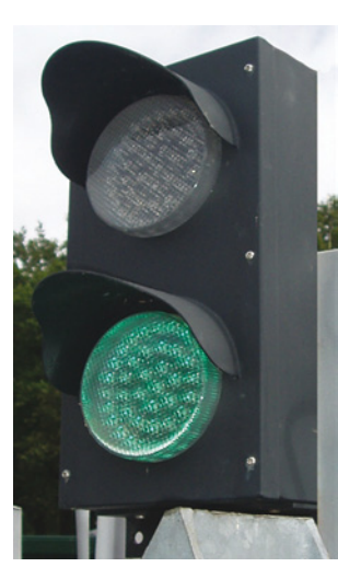
Traffic Light Signals including Car Park "FULL" sign