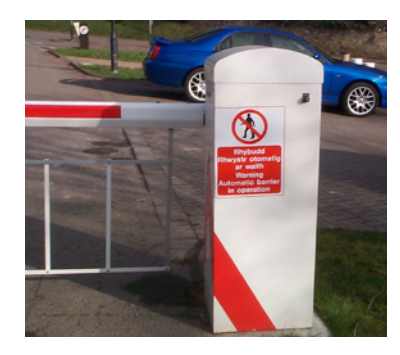
Signage: Boom height, HGV Height, Cabinet mounted warning signs