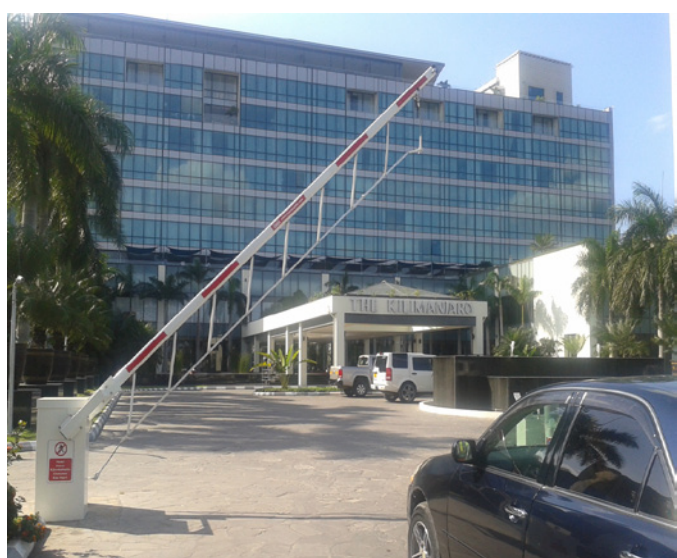
Compact Terra Barrier raising

*This is subject to a risk assessment to ensure the automatic equipment complies to BS EN 12453