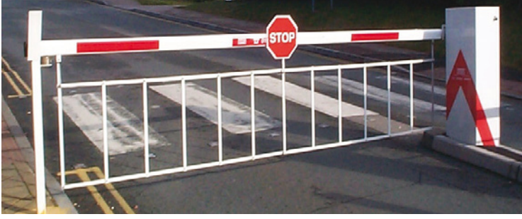
Lower folding skirts