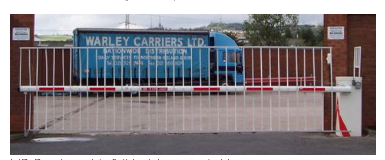
HB Barrier with full height swivel skirt