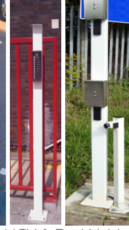
HGV & Dual Height Pedestals for use by cars & HGVsthe road