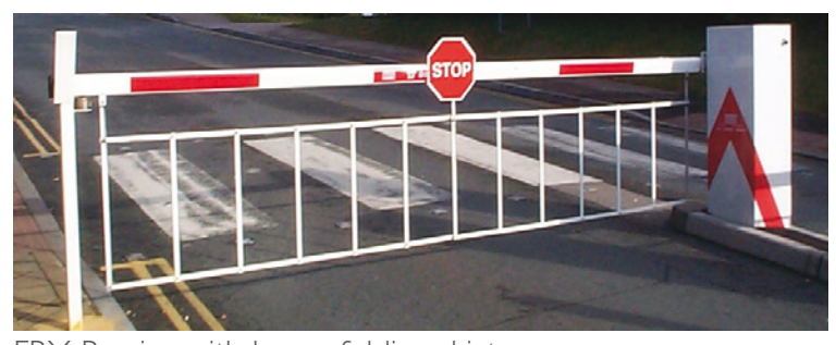
FBX Barrier with lower folding skirt