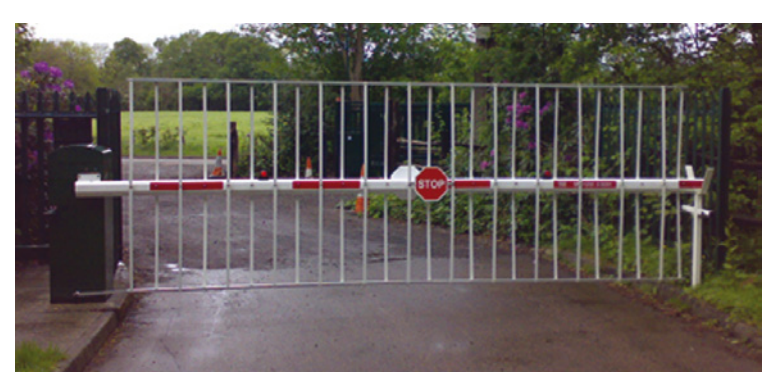
FB Barrier with full height swivel skirt & cabinet in clients choice of colour

A rapid-action torque motor barrier which can support longer boom lengths.