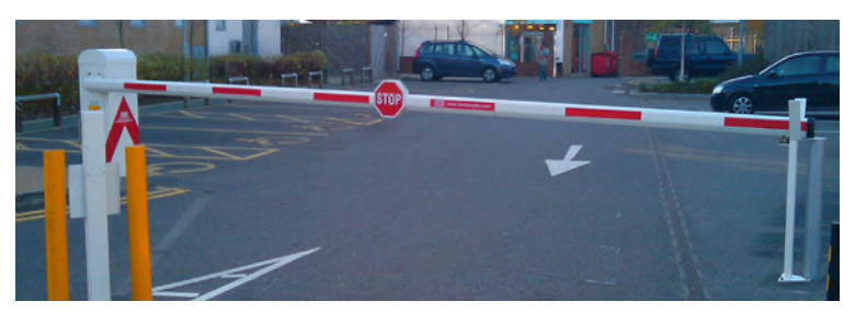
FB Barrier with STOP sign

Up to 9 metres Lower folding skirts up to 7.5m Full height swivel skirt up to 5.5m