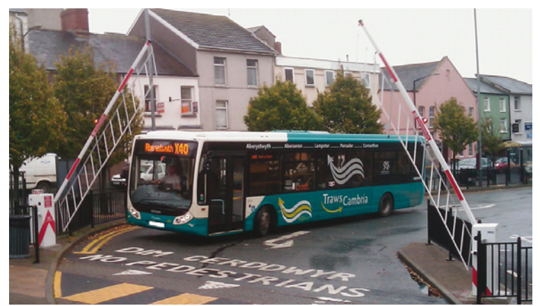
Bi-parting pair of FBX Barriers raising