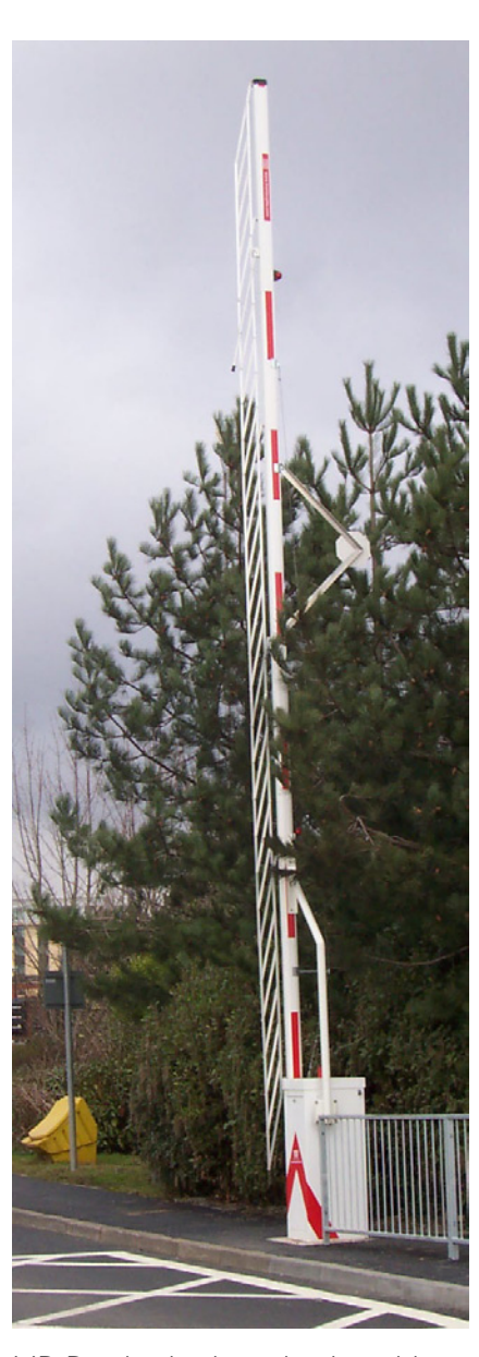
HB Barrier in the raised position.