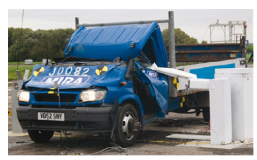
Compact Terra Barrier post impact test