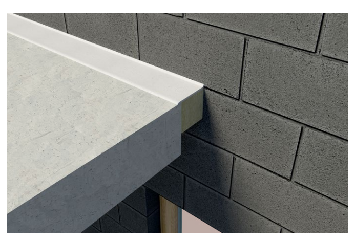
Linear joint seals