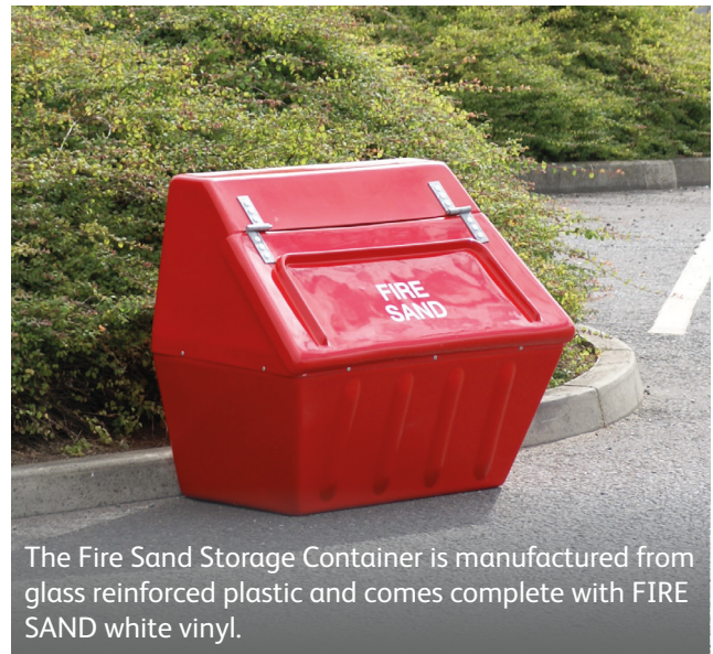
The Fire Sand Storage Container is manufactured from glass reinforced plastic and comes complete with FIRE SAND white vinyl.