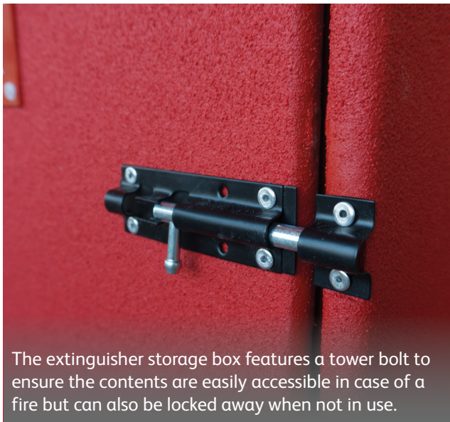
The extinguisher storage box features a tower bolt to ensure the contents are easily accessible in case of a fire but can also be locked away when not in use.