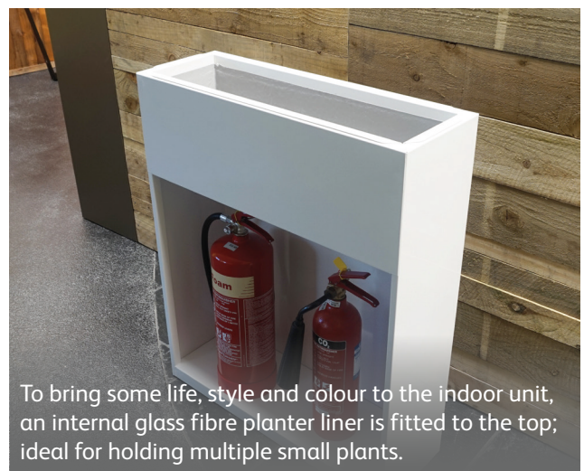
To bring some life, style and colour to the indoor unit, an internal glass fibre planter liner is fitted to the top; ideal for holding multiple small plants.