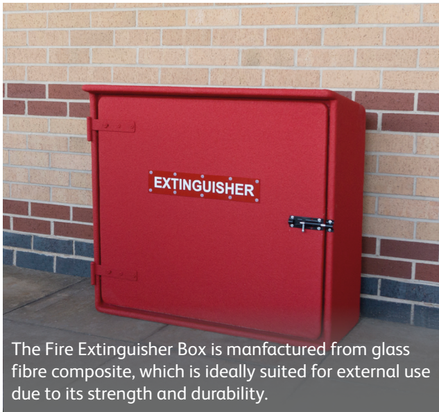
The Fire Extinguisher Box is manufactured from glass fibre composite, which is ideally suited for external use due to its strength and durability.