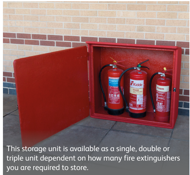
This storage unit is available as a single, double or triple unit dependent on how many fire extinguishers you are required to store.