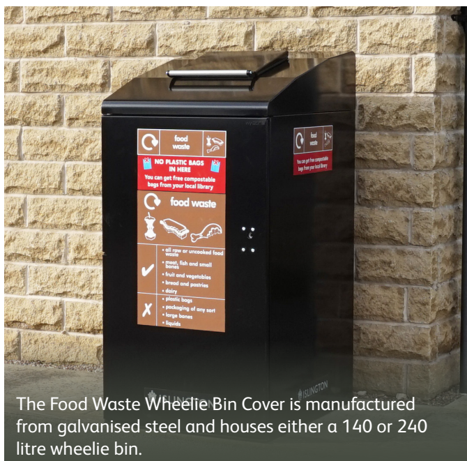
The Food Waste Wheelie Bin Cover is manufactured from galvanised steel and houses either a 140 or 240 litre wheelie bin.