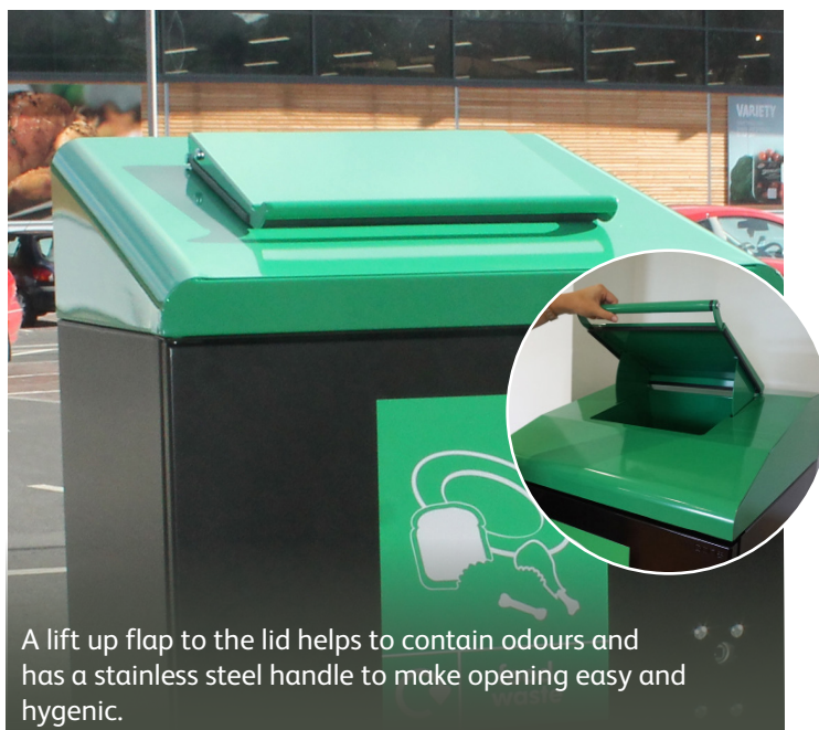
A lift up flap to the lid helps to contain odours and has a stainless steel handle to make opening easy and hygienic.