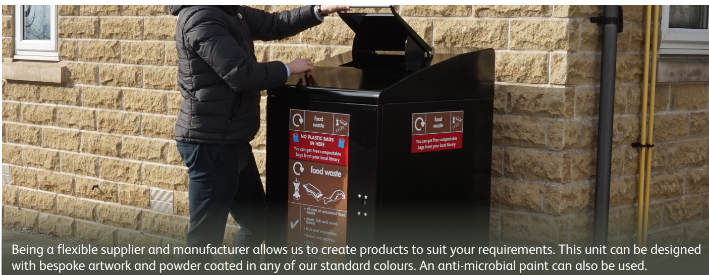
Being a flexible supplier and manufacturer allows us to create products to suit your requirements. This unit can be designed with bespoke artwork and powder coated in any of our standard colours. An anti-microbial paint can also be used.