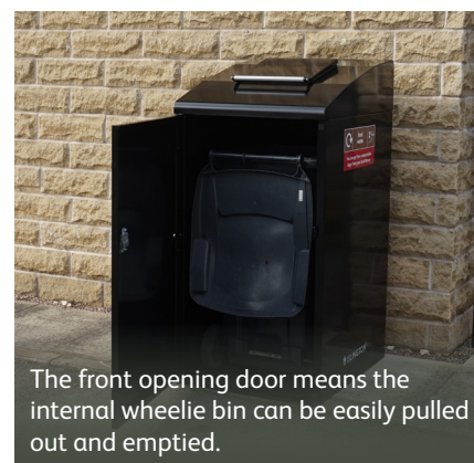
The front opening door means the internal wheelie bin can be easily pulled out and emptied.