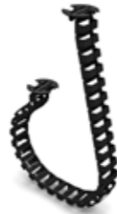
Duet Cable Management

Flexibel cable chain for your Classic frame. Length 1320 mm