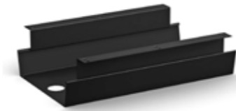
Quatro Cable Tray

Keep track of your power and data cables by collecting them in one place with a Cable Chain. Length 940mm