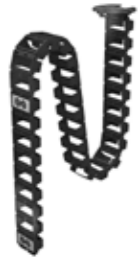
Forte Cable Management

A selection of accessories are available in other colours. Ask us for more information