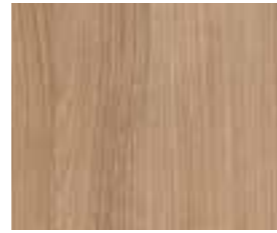
Portofino Cherry D2236