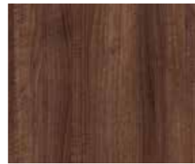
Opera Walnut D481