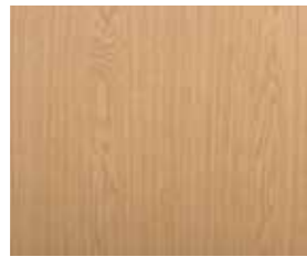
Stone Oak D2217