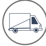
delivery & installation