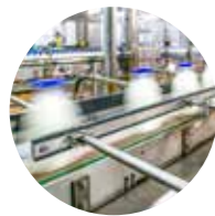
Food and Beverage, manufacturing sites

R&D applications where a temperature controlled environment is required to enable Accelerated Life Testing (ALT) of critical components.