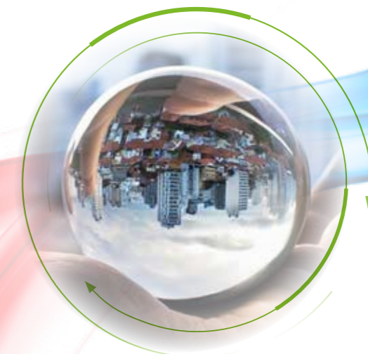
Trane EaaS (Equipment As A Service)