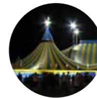
Festivals/ events/ exhibition centers