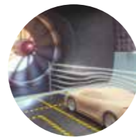
R&D material and high-tech components