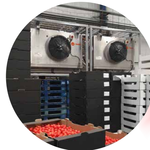
Low Temperature Fan Coil units for food storage